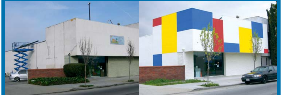
NORTH LONG BEACH CLINIC BEFORE AND AFTER